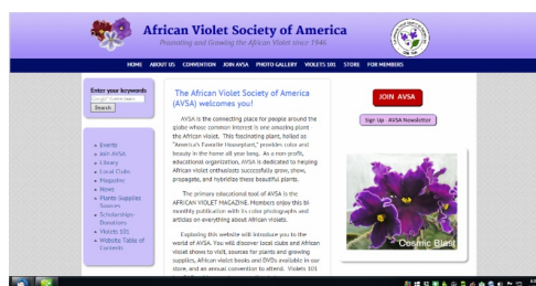
AVSA Website Home Page

But wait... there's more. We know you love to look at photos in the AVSA Photo Gallery on the site but in the For Members section you'll also find the " New Intro Photo Gallery " of some of the most recent new varieties from top hybridizers. In addition, you'll find several useful lists which are published in the African Violet Magazine once each year, including " Best in Show " varieties, the " Best Varieties List " based on an annual membership vote, and the " Honor Roll " of those varieties which have made the list multiple times. Those lists are very useful in selecting new African violets which are proven to grow well! You'll also find the ballot so that you can vote for your favorite violets this year. There's so much more too!