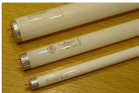
T12 or T8 or T5? Which fluorescent tube is best for African violets?