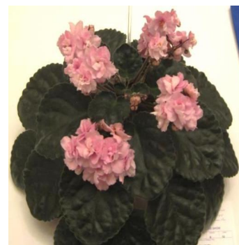
African violet hybrid "Annabelle"