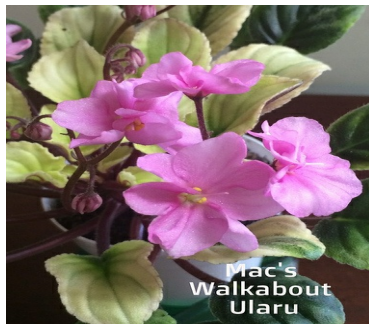
Mac's Walkabout Uluru

David Senk has done more recent hybridizing work with the wasp trait. See the photo (left) of "Senk's Arctic Fox" with its curious trumpet-shaped flower parts. Many of the wasp hybrids also have bustle-back foliage which is very hard to show in photographs but sketches may be seen (along with other blossom and foliage types) in files on the AVSA website.