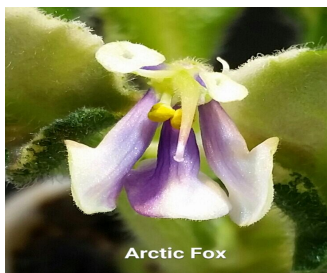
Arctic Fox

David Senk has done more recent hybridizing work with the wasp trait. See the photo (left) of "Senk's Arctic Fox" with its curious trumpet-shaped flower parts. Many of the wasp hybrids also have bustle-back foliage which is very hard to show in photographs but sketches may be seen (along with other blossom and foliage types) in files on the AVSA website.