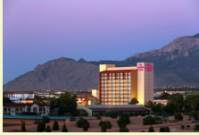
Site of the 2016 AVSA Convention

Crowne Plaza Albuquerque 1901 University Blvd NE Albuquerque NM